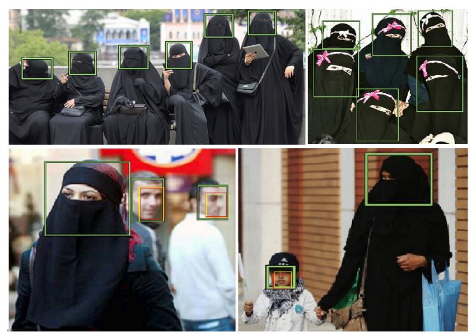
Figure 3. Example of detected faces by Niqab-Face detector indicated by green rectangle. MTCNN yellow rectangle and SSD red rectangle

The training process was performed for approximate of 8 hours until an average precision of 90% and a Recall of 73.5% had obtained. During the testing phase 30% of images not used during training were used to evaluate and measure the model's performance. The major aim of our findings is to classify occluded face within an image and providing the face location within image as set of bounding box coordinates if there is face. Niqab-Face detector has successfully identified 261 as TP, one FP, and 179 as FN, with 99% and 59% for precision and recall respectively.