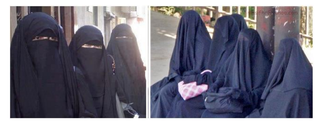
Figure 1. Examples of heavily occluded faces covered with Niqab

The successful implementation of machine learning from the stunning work of Viola and Jones has triggered a lot of improvements in face detection (Viola & Jones, 2001). The covering may be due to work requirement such as masks as in hospitals or due to religious beliefs as in some Muslim societies where ladies are required to cover their faces while being outdoors or in the presence of non-relatives.