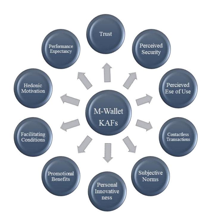
Figure 3. Mobile wallet key adoption factors