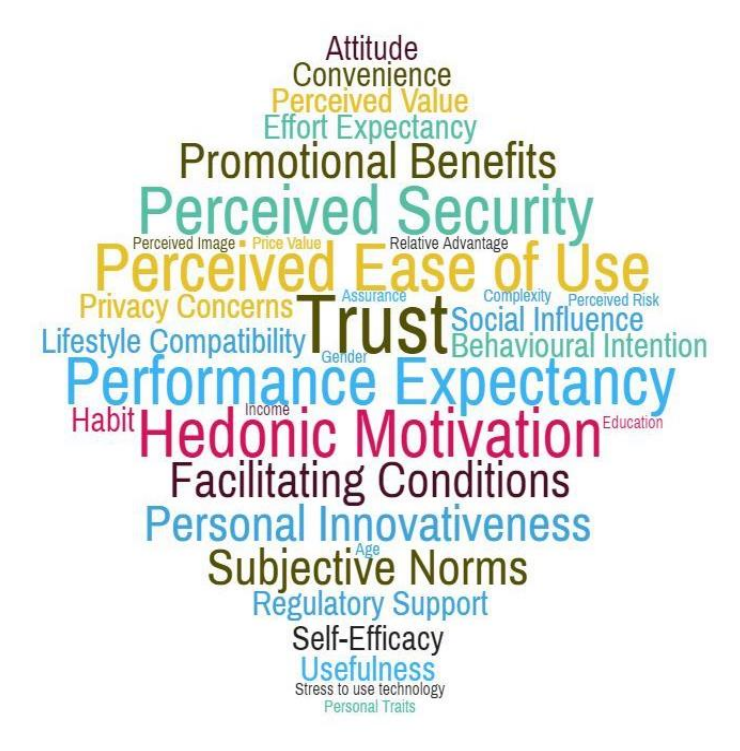
Figure 2. Adoption Factors Word cloud