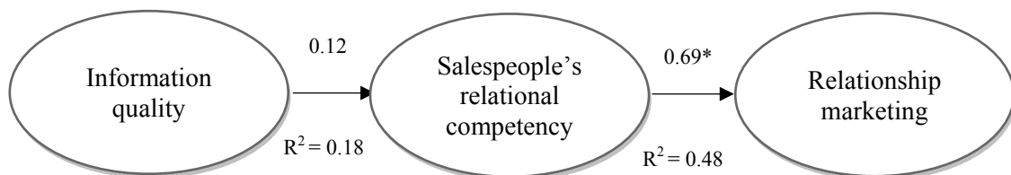
Fig 2. Results of SEM on the mediating role on salespeople's relational competency

Due to the fact that salespeople's relational competency cannot act as a mediator variable in H2, based on the results from SEM (Figure 2), H3 is rejected and thus the mediator role of salespeople's relational competency in the relationship between information quality and relationship marketing is rejected.