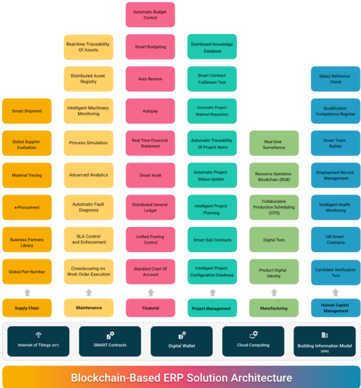
Figure 2 . Blockchain-based ERP Architecture

The architecture model that represents all functional areas and supporting technologies is illustrated in figure 2.