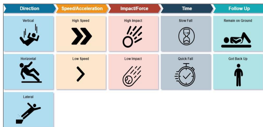
Figure 1. Types of Falls

Got Back Up: The person was able to get back up by himself.