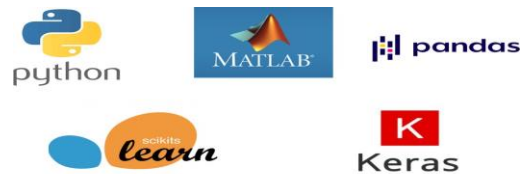
Figure 5. Tools and Technologies used in Machine Learning

Matlab is a software environment and scientific programming language which supports simple as well as advanced mathematical features. The programming language is used to write scripts performing various actions while the environment is used to execute the scripts and see the output. It also provides a collection of tools for analysis, visualizations, debugging. It is the standard programming environment used in the fields of mathematics and science and is also widely used to implement and test machine learning algorithms.