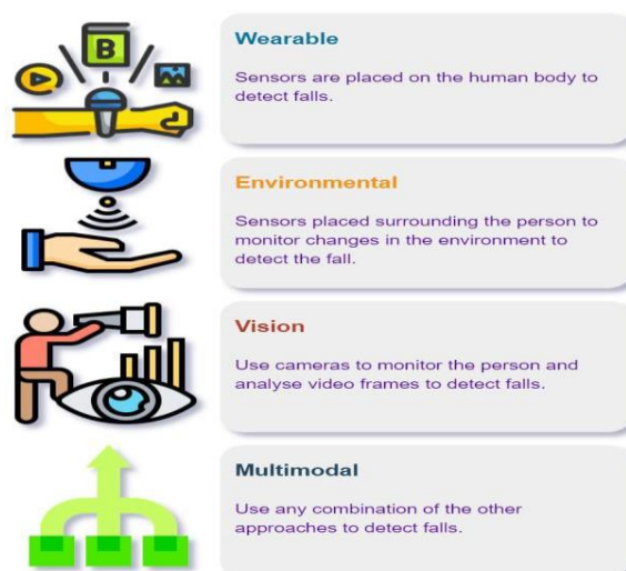
Figure 2. Types of Fall Detection System

Multimodal: multimodal systems use a combination of the other types to detect falls. In this way, multiple measurements from different domains are combined to give a more definite or accurate detection on falls. UP Fall Detection for example (Martínez-Villaseñor, L. et al. 2019) uses a multimodal approach for fall detection, where a combination of wearable Inertial Measurement Unit (IMU) sensors, Electroencephalography (EEG) Headset, cameras, infrared sensors are all combined to detect falls. Multimodal approaches can often increase accuracy and decrease false positives, due to having multiple types of sources for measurements, which give more accurate and definite classifications. However, they are more complex to implement since there will be more data points to process and analyze.