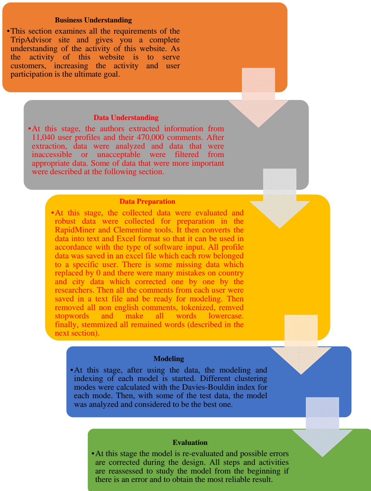
Figure 2. CRISP-DM cycle used in this study

The CRISP-DM cycle used in this study is indicated in Figure 2: